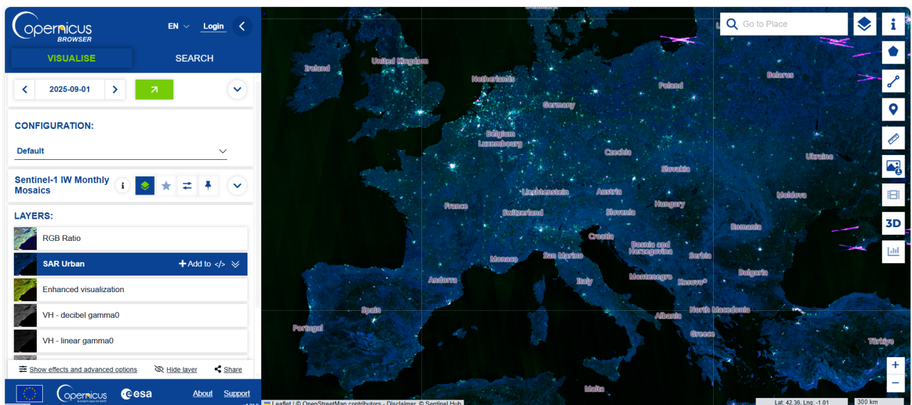
SAR Urban map from Sentinel-1