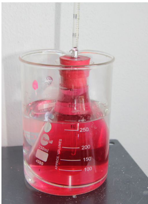
Experimental setup to demonstrate thermal expansion of water.