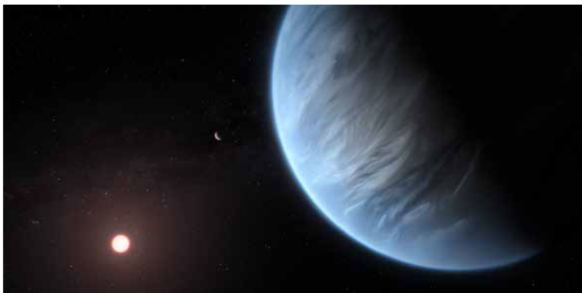
Artist's image of exoplanet K2-18b, which is known to have water and temperatures that could support life ESA/Hubble, M. Kornmesser, CC BY 4.0

Even exoplanets that are not true water worlds, in the sense of being completely enveloped in a global ocean, may still be