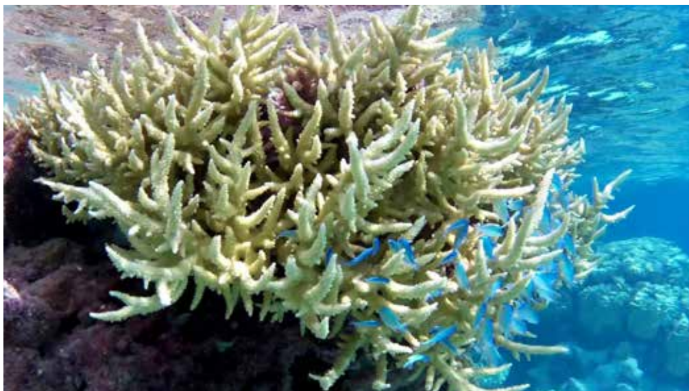
Coral reef in French Polynesia – an exotic life form on Earth

We might expect to find this kind of evolutionary mash-up on the most Earth-like exoplanets and moons, but things could get even weirder in places with a more exotic chemistry – such as Saturn's moon Titan, where seas are made of liquid methane rather than water. The Cassini-Huygens mission