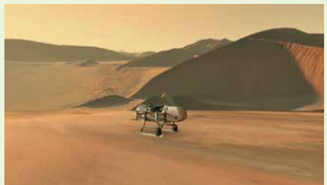
Artist's illustration showing NASA's Dragonfly lander on the surface of Titan