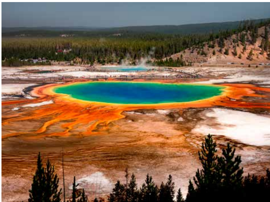
Grand Prismatic Spring in Yellowstone Park, USA. The colours are due to microbial mats formed by thermophiles.

Another interesting feature of geothermal sites such as hot springs is that there is often a sharp temperature gradient: deeper underwater zones are hotter, while those towards the pool's edge are cooler. Different thermophiles find a comfortable niche at different points along the gradient. Thermophiles that can photosynthesise, such as cyanobacteria, live at the cooler end of the gradient, while less brightly coloured types are restricted to the thermal extremes. The result is a multicoloured 'microbial mat' carpeting the rock, with each zone of colour representing the distinct biochemistry of the organisms present, from the yellow-green colours of those that photosynthesise to the diverse shades of those that obtain energy by metabolising hydrogen, iron or sulfur compounds. A famous example of