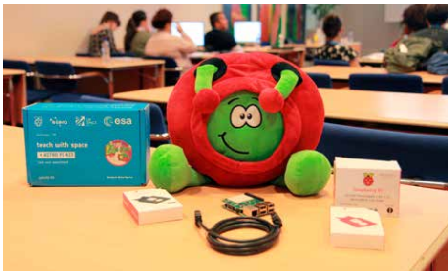
Teams receive an ESA Astro Pi kit to create and test their experiments.

students up to the age of 19 are invited to enter the European Astro Pi Challenge and design a scientific experiment that could be run using one of the Astro Pi computers on the ISS. As part of their design, students provide the necessary programming code. One of the main goals of the challenge is to inspire as many students as possible to participate in space science using code