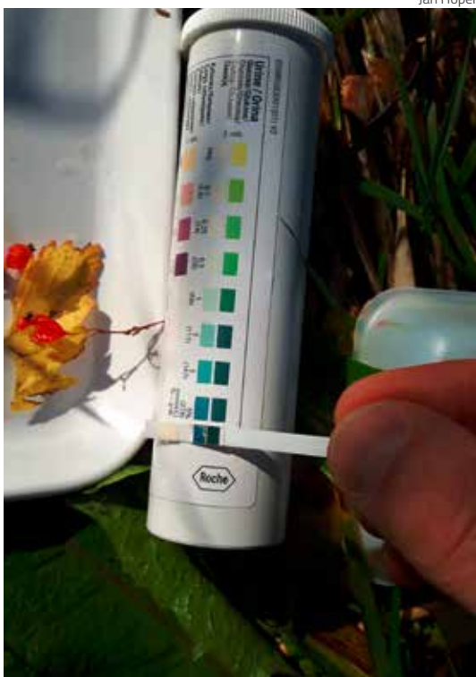
Figure 1: Testing redcurrants ( Ribes rubrum ) for glucose: the test strip matches to a high reading on the reference scale.