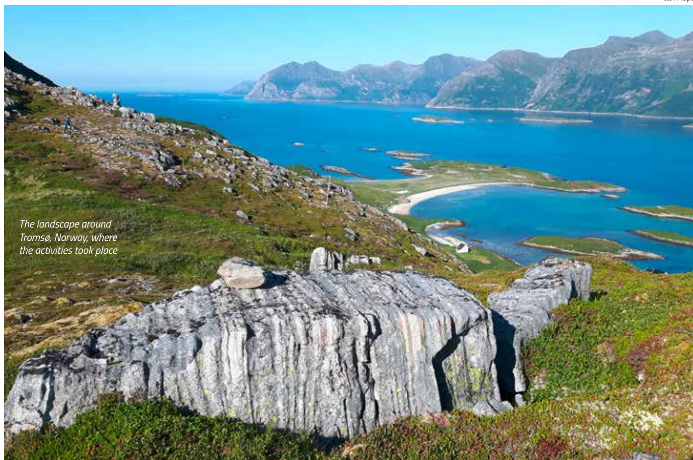
The landscape around Tromsø, Norway, where the activities took place