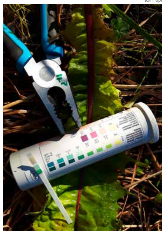
Figure 2: Testing dandelion ( Taraxacum officinale ) leaves for glucose, showing a lower glucose concentration than in berries