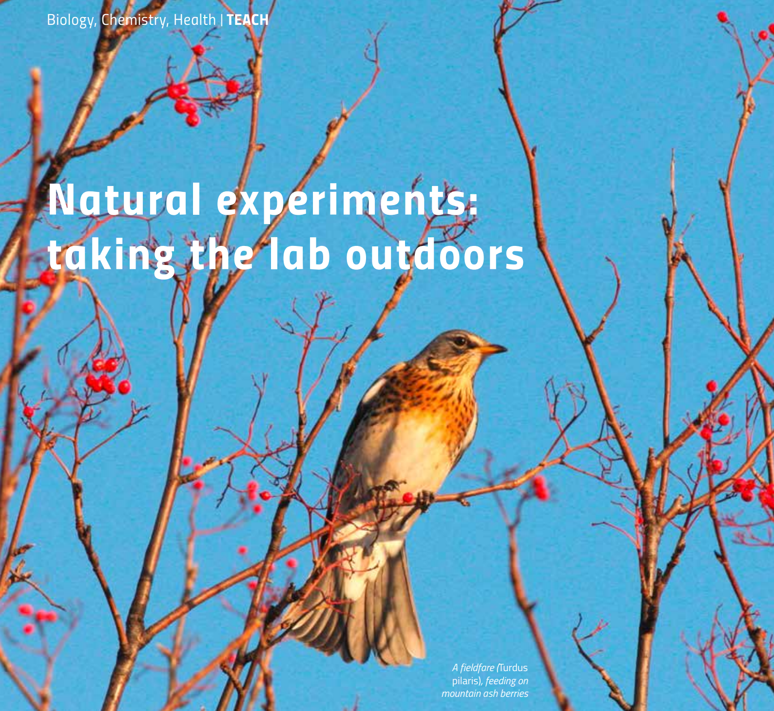
A fieldfare (Turdus pilaris), feeding on mountain ash berries