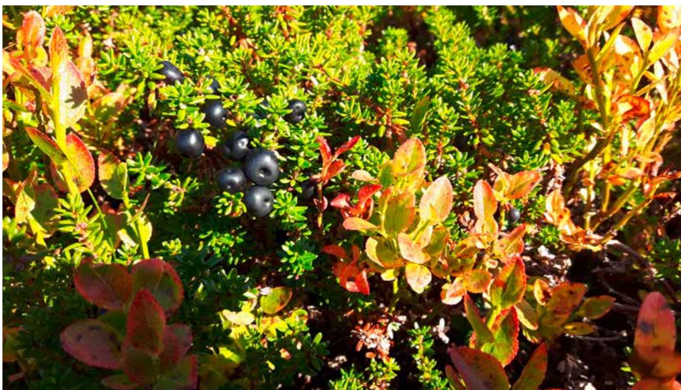
Blueberry and crowberry bushes. Like many other berries, these contain high levels of glucose.