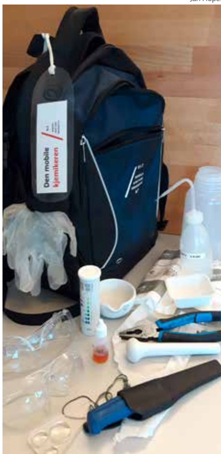
Figure 3: The investigation bag with its content for glucose and starch testing