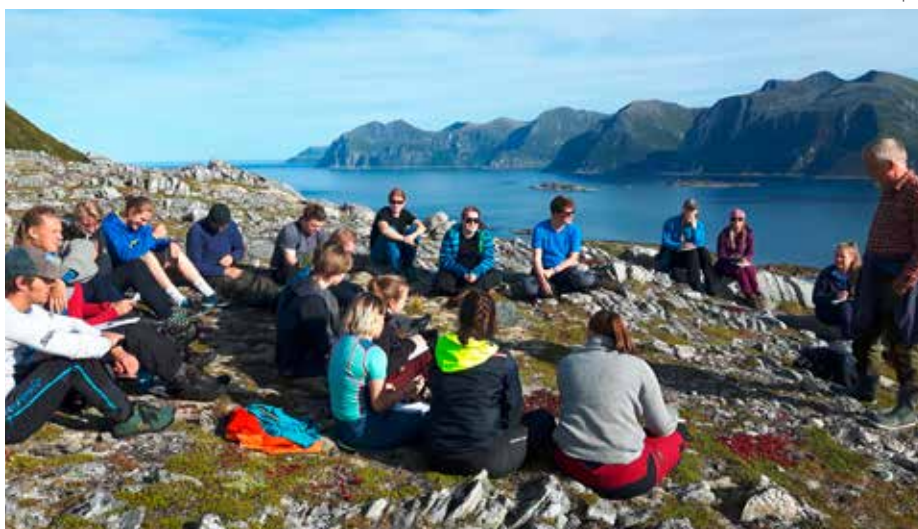
Field work in the Arctic: students enjoy fine weather while studying science outdoors

To test for starch, we used the iodine test in the form of Lugol’s solution (aqueous potassium iodide and iodine), as this simple test is well suited to taking out of the classroom, and only needs one droplet to produce a result.