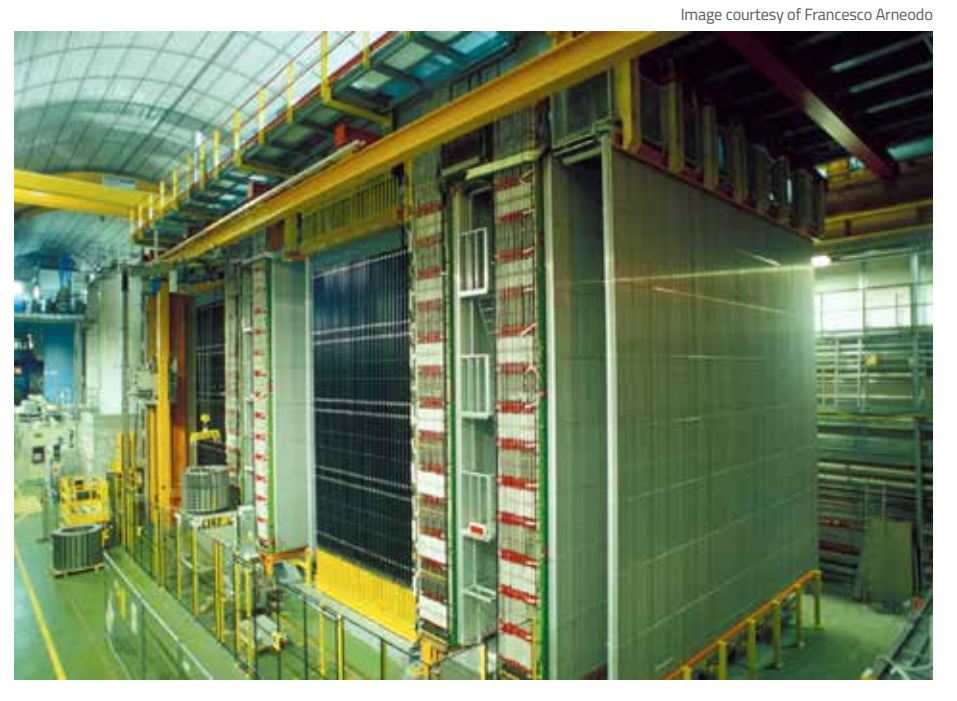
Hall C of the Gran Sasso Laboratory, Italy, with the OPERA (Oscillation Project with Emulsion tRacking Apparatus) experiment installed

In 1987, some underground observatories were amazed to register several neutrinos in just a few seconds; they had witnessed the neutrino signal from supernova 1987A, in the Large Magellanic Cloud (Nakahata, 2007).