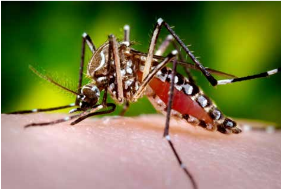
Our skin is the first line of defence against infection.