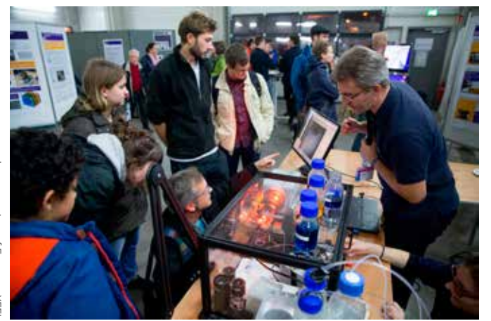
The European XFEL exhibition at the Hamburg Night of Science

While the European X-ray Free-Electron Laser (European XFEL) is very busy with construction and technical preparations, its employees have been engaged in several outreach and education activities. In late September 2015, for example, European XFEL scientists led an intensive graduate-level lecture course on X-ray free-electron science in materials research to students from the Technical University of Freiberg in Germany.