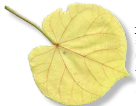
Variegated leaves are very varied

measurements and there is variation in the results, then the students may confront the contradictions they find. Even then, some students may disregard incongruent evidence, thinking that it is ‘wrong’. This could be an appropriate occasion to discuss elementary statistics and probability. Students could discuss what kind of sampling would be ‘fair’: for example, purposely choosing leaves of certain sizes, picking all or a certain number of the leaves from one branch, or using a particular number of leaves. A truly meaningful investigation would require fairly sophisticated statistics, more suitable for older students (aged 16–19).