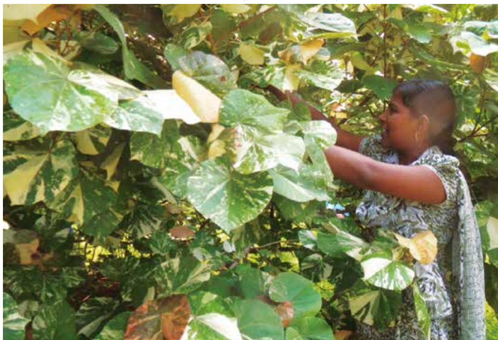
Examining a bhendi shrub