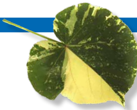
A variegated bhendi shrub, Talipariti tiliaceum

While investigating these relationships, we might make two hypotheses. One is that the white leaves will be stunted because they contain less chlorophyll, which is needed for photosynthesis to occur. An alternative hypothesis is that the white leaves, or the white parts of leaves, will not be stunted because the leaves still contain a dense network of veins that