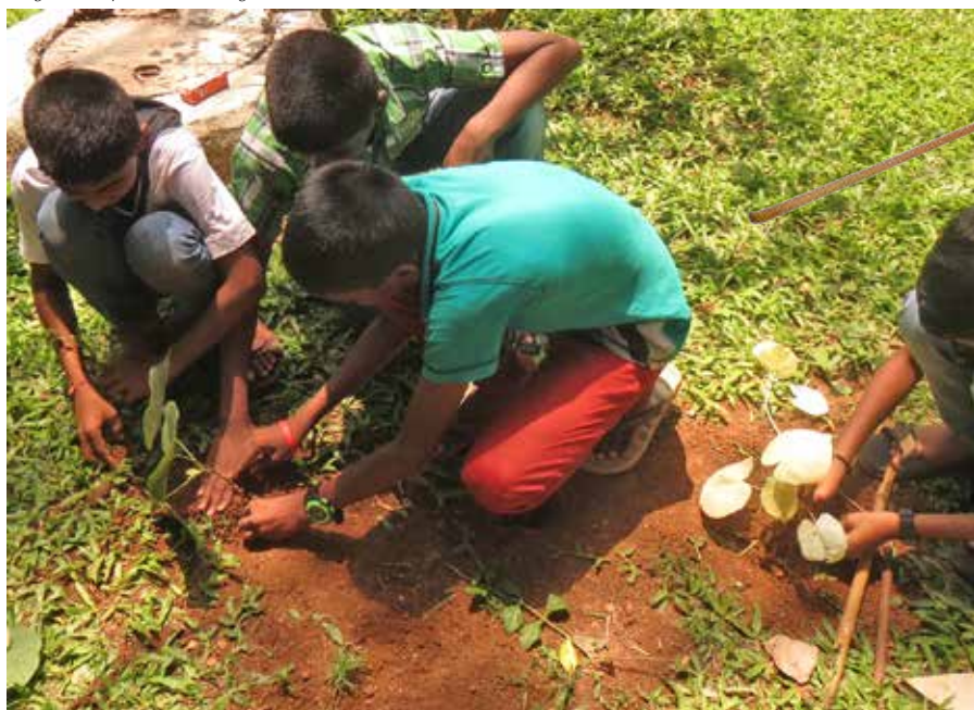
Placing branches in soil