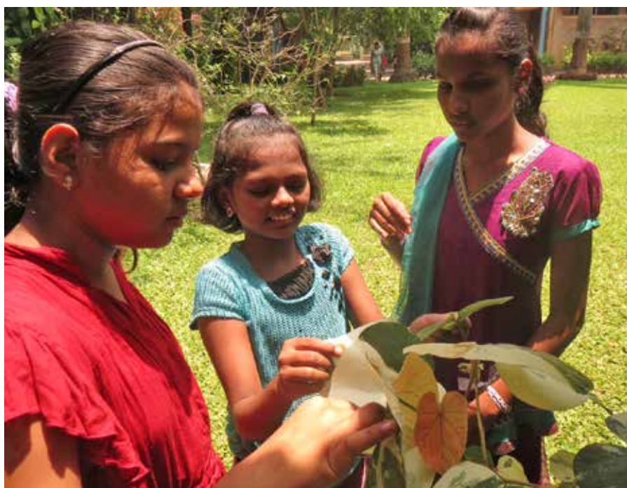
Figure 4: Testing white and green leaves to find out which is thicker

indicates that the white leaves initially contained more water, but that the green leaves had more bulk (dry weight). Apparently the white leaves had produced – or at least stored – less food.