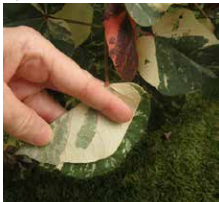
Figure 2: Folding a leaf to find out whether the mostly green side is larger than the mostly white side