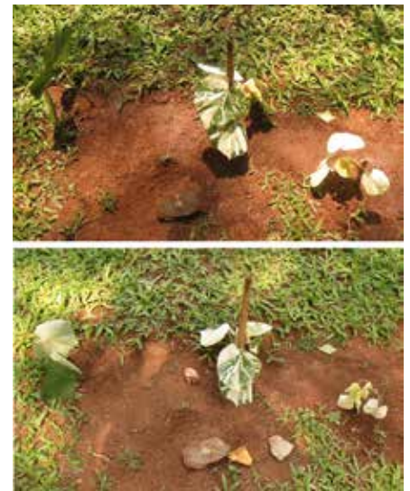
Before and after of branches of white, green, or mixed white and green leaves placed in soil overnight.

measurements and there is variation in the results, then the students may confront the contradictions they find. Even then, some students may disregard incongruent evidence, thinking that it is ‘wrong’. This could be an appropriate occasion to discuss elementary statistics and probability. Students could discuss what kind of sampling would be ‘fair’: for example, purposely choosing leaves of certain sizes, picking all or a certain number of the leaves from one branch, or using a particular number of leaves. A truly meaningful investigation would require fairly sophisticated statistics, more suitable for older students (aged 16–19).