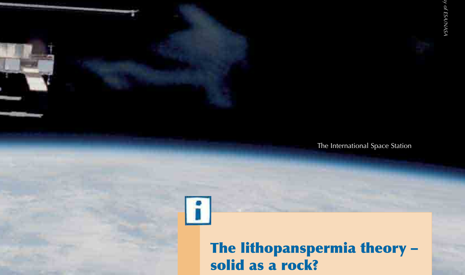
The International Space Station