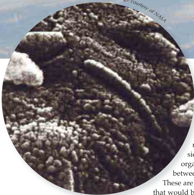
High-resolution scanning electron microscope image showing an unusual tube-like structural form that is less than 1/100 th the width of a human hair in size, possibly representing the remains of extraterrestrial bacteria, found in meteorite ALH84001, a meteorite believed to be of Martian origin

therefore, we used basalt: readily available on Earth and similar to Martian rock.