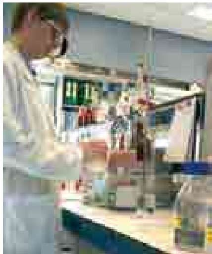
Titration in a Dutch laboratory