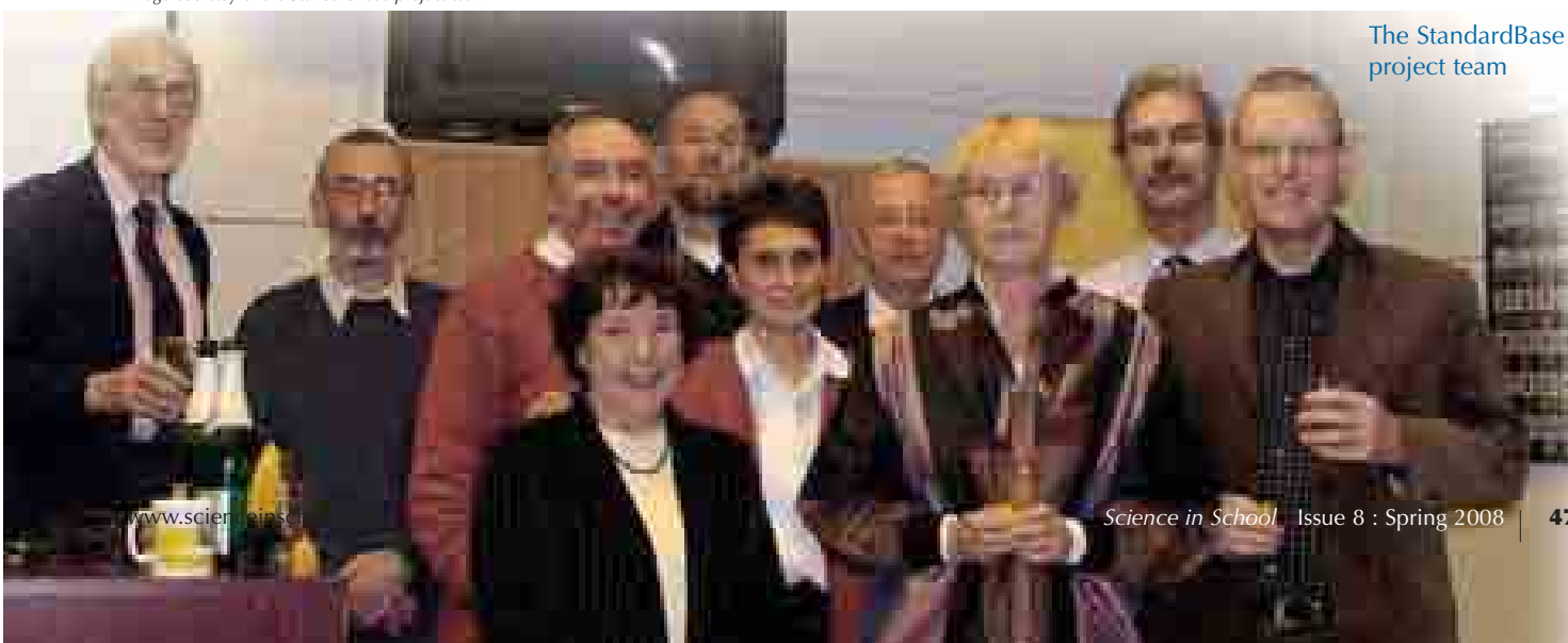
The StandardBase project team