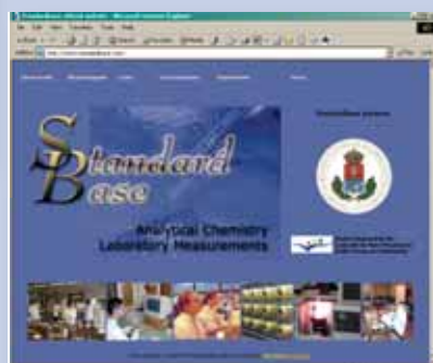
The main page of the StandardBase website