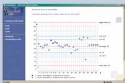
A graph including the results of the determination of the iron content in mosskiller

So, the analytical techniques and underlying theory remain, but students are also challenged to use them in a situation that imitates authentic workplace practice. Therefore the ProBase project team (formed by the same partners who took part in the