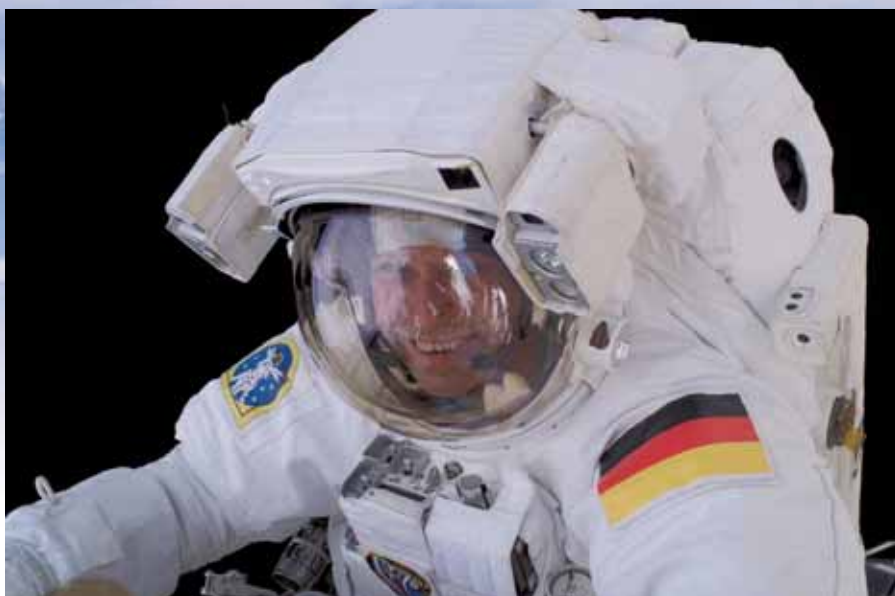
Thomas Reiter during the spacewalk on 3 August 2006

The first severe effects were still perceivable the morning after landing, but then recovery progressed very nicely. Right now, four weeks after landing, I don't feel anything. So within three to four weeks the effects are almost over.