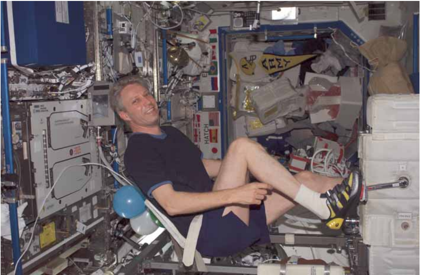
Exercising on board the ISS