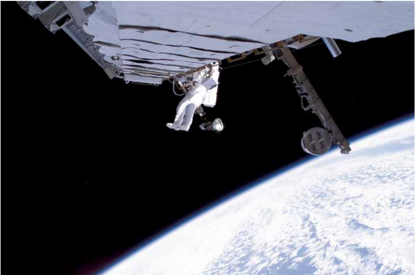
Thomas Reiter works on a cooling line on the International Space Station

debriefings for the scientists, operations people and management.