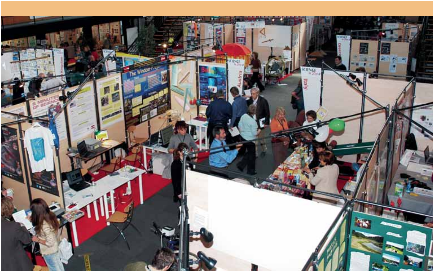
The science teaching fair