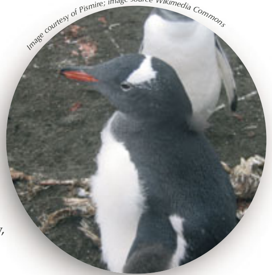
Gentoo penguin ( Pygoscelis papua )