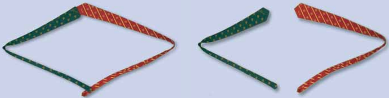
Demonstrating mitosis with ties