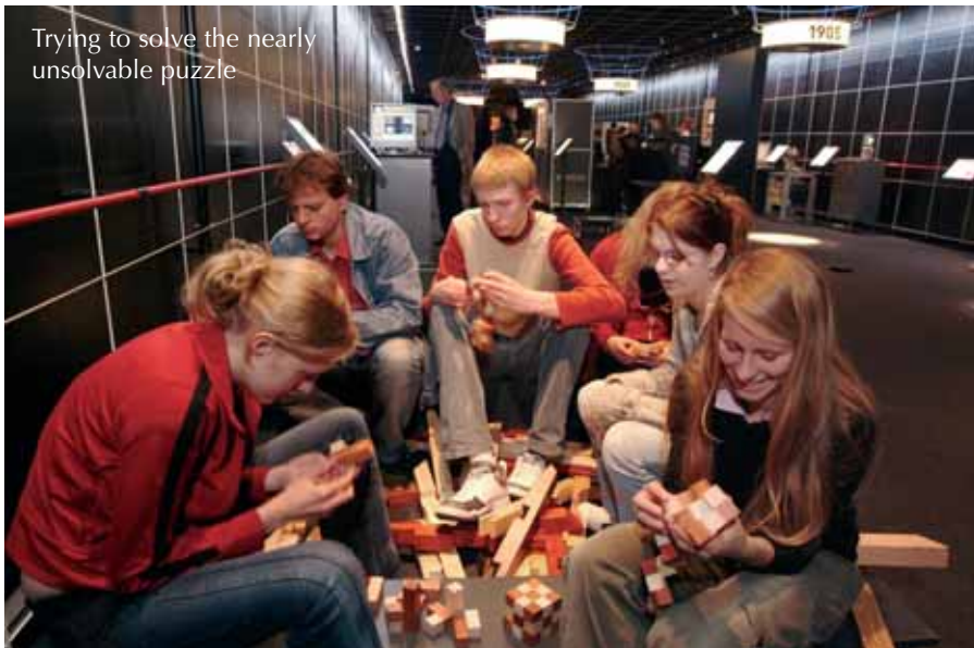
Trying to solve the nearly unsolvable puzzle

children and adults for exploration and investigation. The students cooperated to try to find solutions to the tricky puzzles on display; for example, try to join nine points (arranged in rows of 3 x 3) with four straight lines. Everyone wanted to try their own luck and numerous attempts failed. With a helpful hint from one of the exhibition's organisers, however, the students finally succeeded and the resulting euphoria accompanied them to the next table and the next challenge.