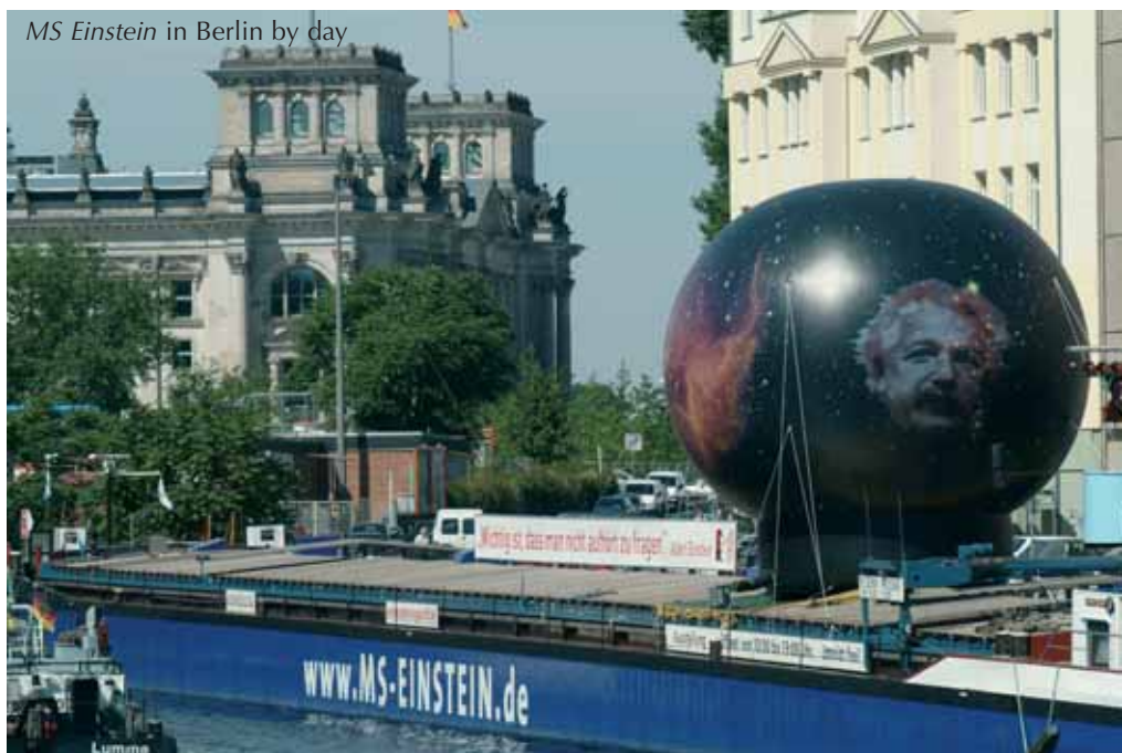
MS Einstein in Berlin by day