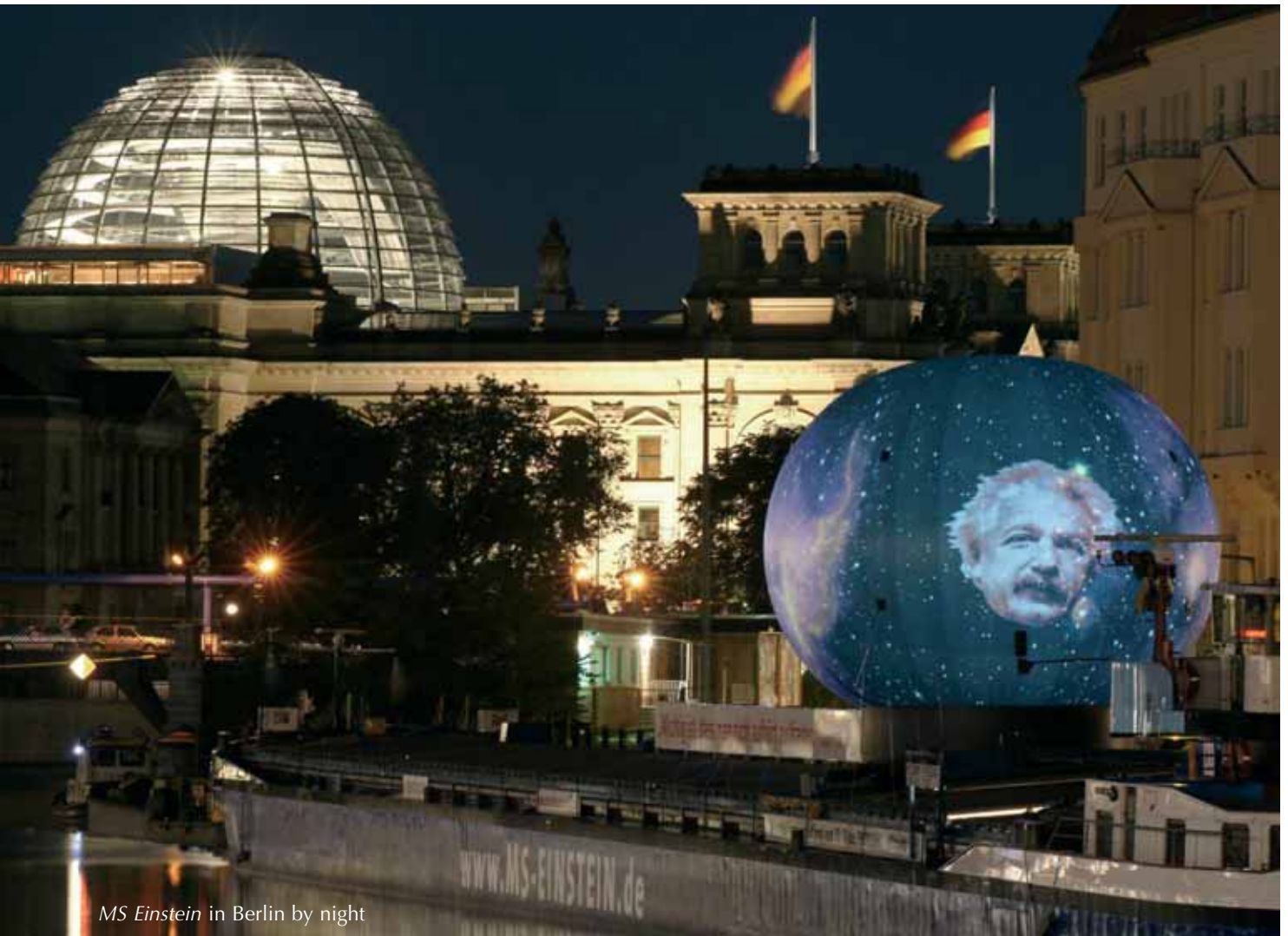
MS Einstein in Berlin by night

months, was then rapidly set up on board. Crewed by young scientists, the exhibition was free to visit.