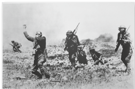
Picture posed in France, near front-line trenches, by Major Evarts Tracey, Engineer Corps, USA, to illustrate effects of phosgene gas, 1918