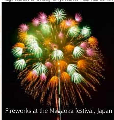
Fireworks at the Nagaoka festival, Japan

fireworks themselves, have been found. Firework displays have also been linked to elevated levels of other