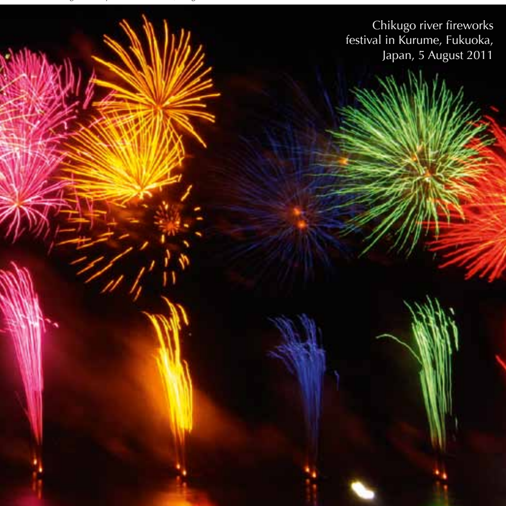
Chikugo river fireworks festival in Kurume, Fukuoka, Japan, 5 August 2011