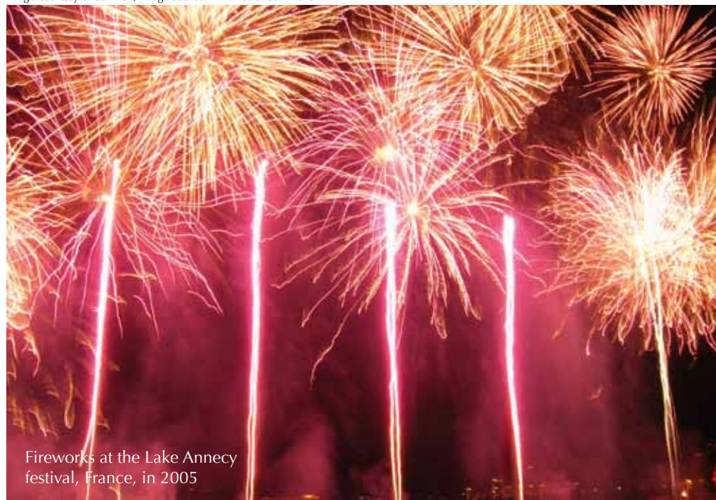
Fireworks at the Lake Annecy festival, France, in 2005

ropean countries. Note, however, that the files are large so can take some time to download, and are also less simple to understand than the UK and Maltese data sets.