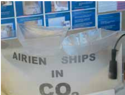
Light boats floating on CO 2