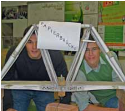
A strong paper bridge which can carry up to 1.6 tonnes